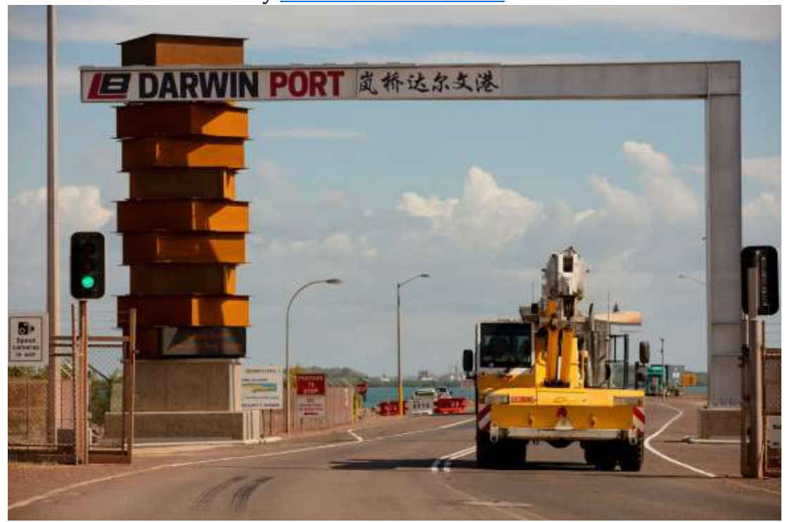
There is debate on whether to review the Chinese government's 99-year lease on Darwin port.

In the Albanese government's in-tray are high stakes questions like whether Minister for Foreign Affairs Penny Wong should use powers under the Foreign Relations Act to effectively <u>veto Confucius Institutes</u> at Australian universities.