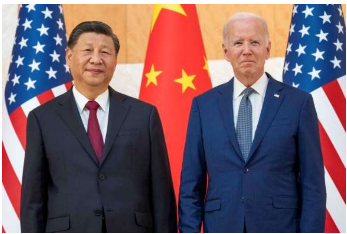
US President Joe Biden with Chinese President Xi Jinping before a meeting at the G20 summit in Bali. Indonesia.

Despite recent smiles for the camera between <u>presidents Xi and Joe Biden</u>, the US-China relationship remains riven by deep-seated mutual suspicion.