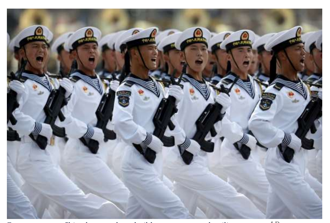
For many years China has sought to build a super-strength military.

With tough policies now bipartisan consensus in Washington, the Chinese government will redouble these efforts.