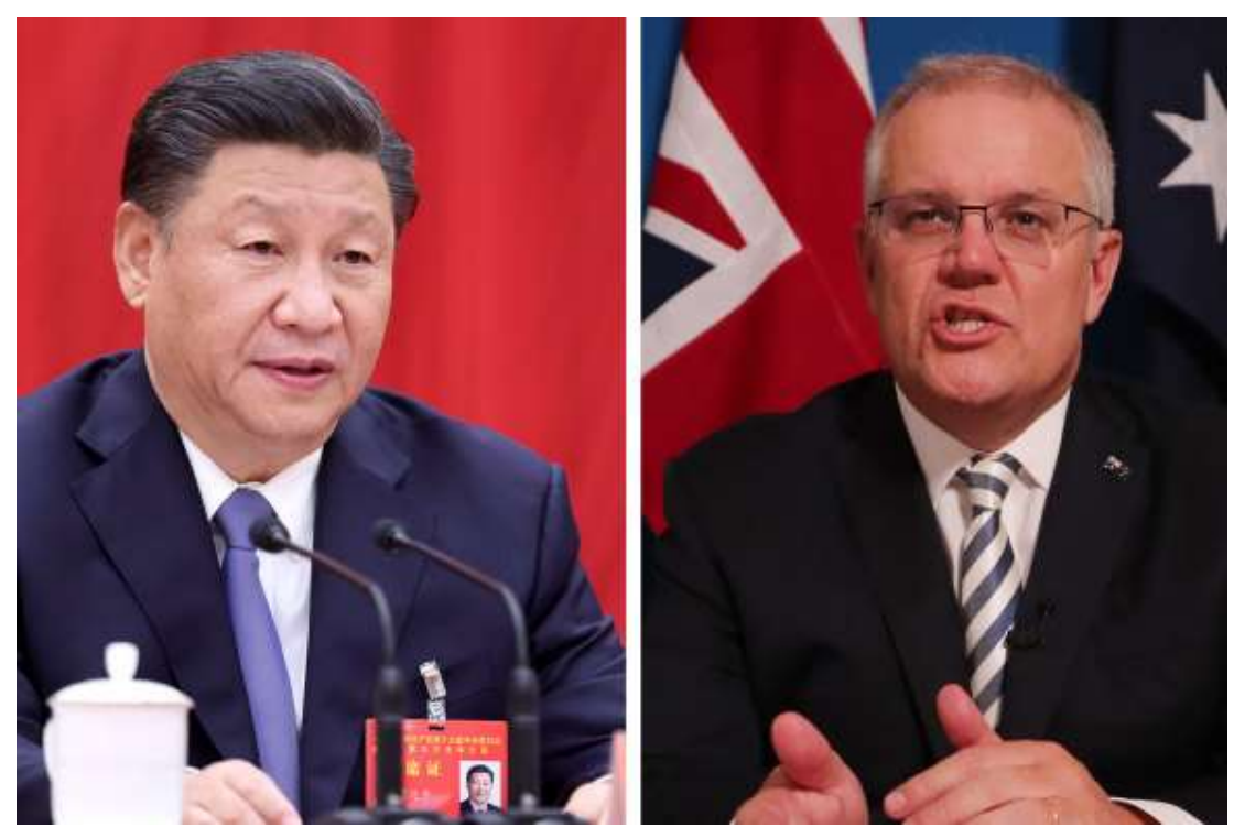
Relations between China and Australia hit new lows under former prime minister Scott Morrison.

These very real risks don't mean that Canberra should hold back from making tough China policy decisions.